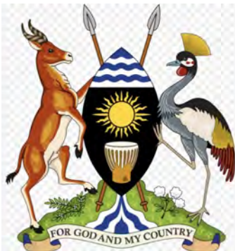
Ugandan Ministry of Health